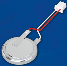
Lithium Button Cells