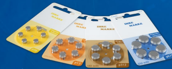
Hearing Aid Batteries