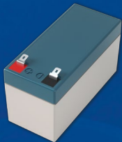
Lead Acid Batteries (VRLA)