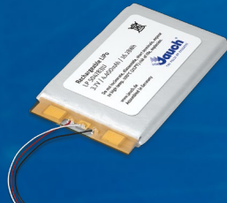
Lithium Polymer Batteries