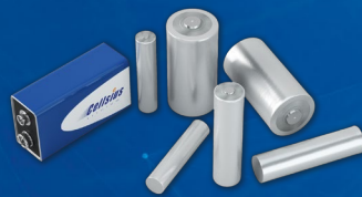
Cylindrical Lithium Batteries