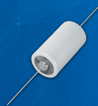
Lithium Thionyl Chloride Batteries