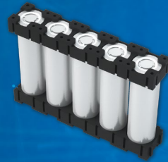
Lithium Iron Phosphate Batteries